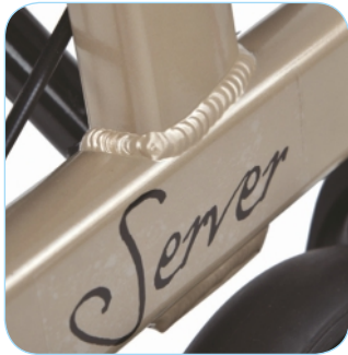
Unique triangle aluminium profile ensures the durability up to 150 kg.