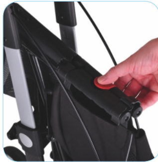
Stays firmly closed with the lock and is easy to open with the push button.