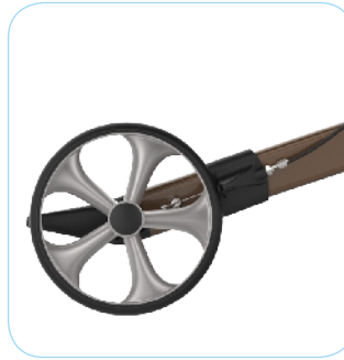
Maintenance free brakes and TPE-covered unbreakable wheels.