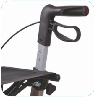
Smooth adjustable handle height and lockable handbrakes.

The Server is available in 3 sizes – small, medium and large – with a range of settings within these sizes. The push handles are easy height adjustable in a range of 60 - 102 cm.