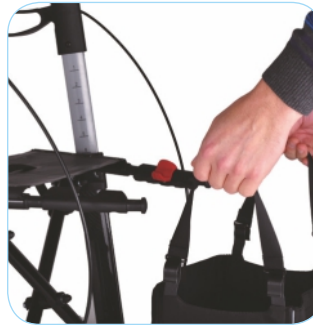
Practical easy-to-remove shopping bag with special designed easy-to-go clips.